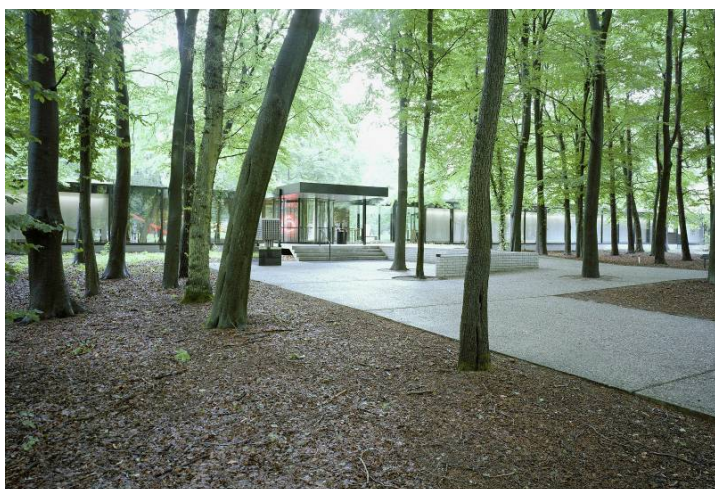
Kröller-Müller Museum entrance.

Kröller-Müller Museum (KMM) Houtkampweg 6 6731 AW Otterlo The Netherlands www.kmm.nl